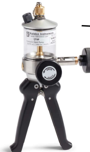
QTQT-HOS3' 3' microbore hose